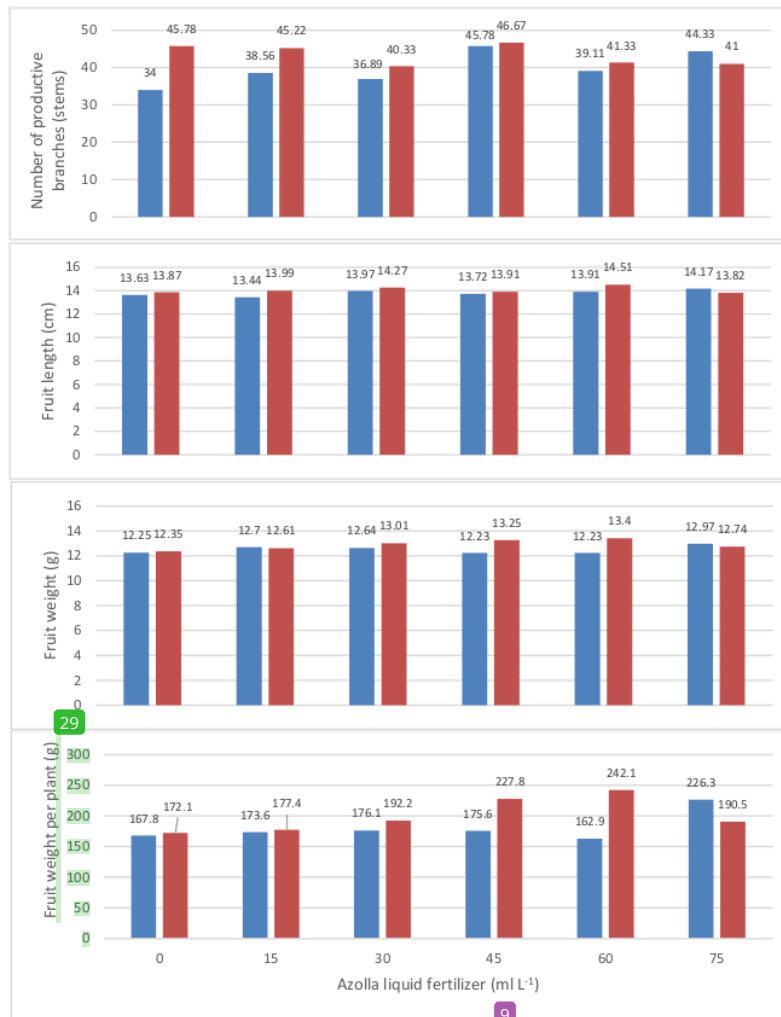
Figure 1. Average number of productive branches (stems), fruit length (cm), fruit weight (g), and weight of fruit per plant (g) of chilli ( Capsicum annuum L.) on different dose of Trichoderma asperellum and Azolla liquid organic fertilizer.

branches (34 stems). The treatment of Trichoderma asperellum 4 g plant -1 with a dose of Azolla liquid organic fertilizer of 60 ml L -1 produced the highest fruit length of 14.51 cm while in the treatment without Trichoderma sp. with a dose of liquid organic fertilizer 15 ml L -1 (t1p1) produced the lowest length of fruit of 13.44 cm. Treatment of Trichoderma asperellum 4 g plant -1 with a dose of liquid organic fertilizer of 60 ml L -1 (t2p4) produced the highest fruit weight of 13.40 g while in the treatment without Trichoderma sp. with a dose of liquid organic fertilizer of 45 ml L -1 (t1p3) produced the lowest fruit weight of 12.23 g. The treatment of Trichoderma asperellum 4 g plant -1 with a dose of liquid organic fertilizer of 60 ml L -1 (t1p4) produced the highest fruit weight per plant which was 242.1 g while in the treatment without Trichoderma sp. and the dose of liquid organic fertilizer 60 ml L -1 (t1p4) produced the lowest fruit weight per plant that is 162.9 g.